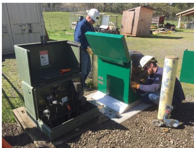
PGE LVR 420002_8/6/20 CU 1